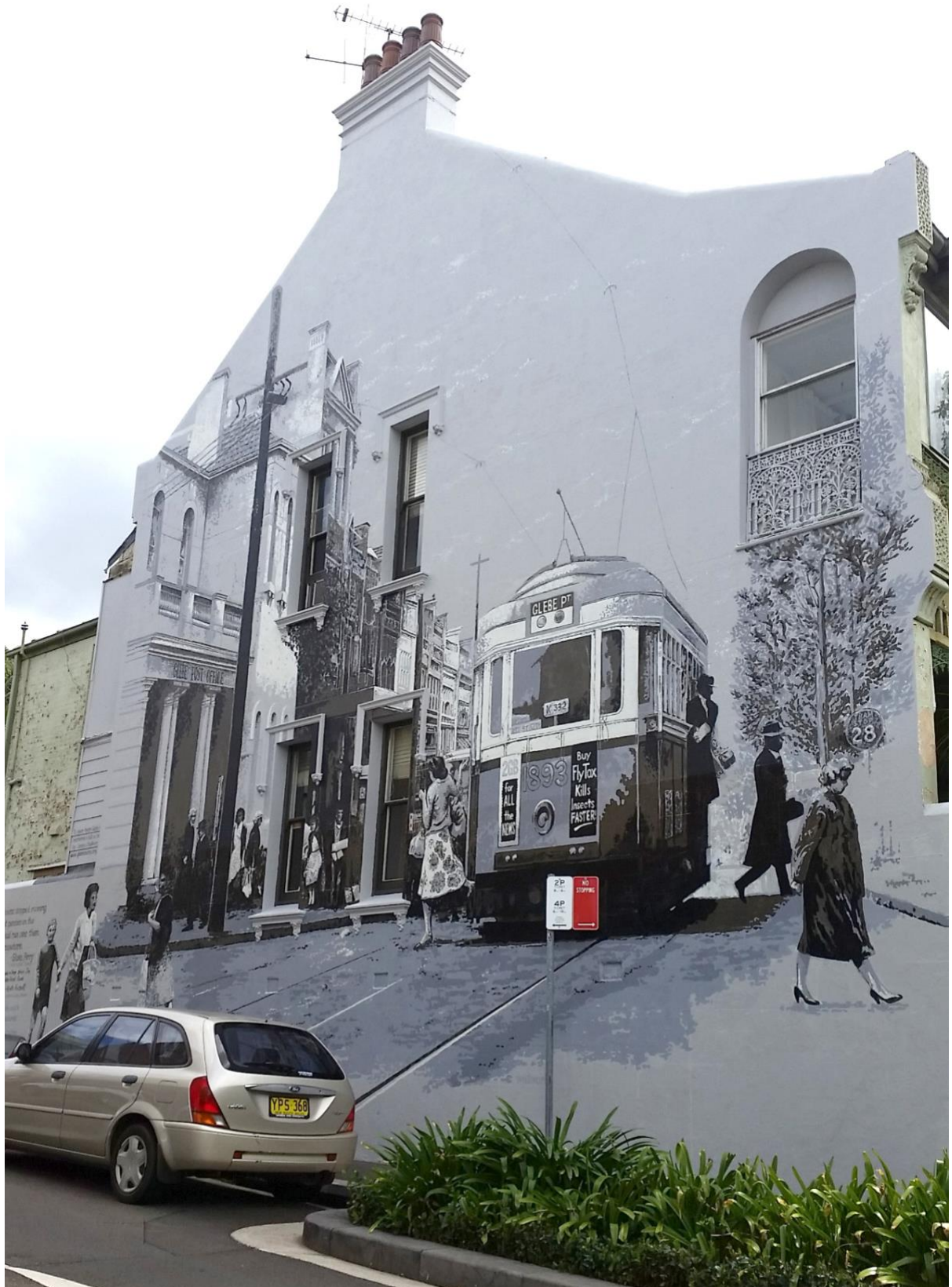
TRAM mural, The GLEBE SOCIETY, City Of SYDNEY, 2017